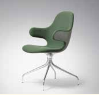
CATCH CHAIR JH2 BY JAIME HAYON