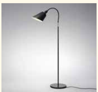
BELLEVUE AJ2 BY ARNE JACOBSEN