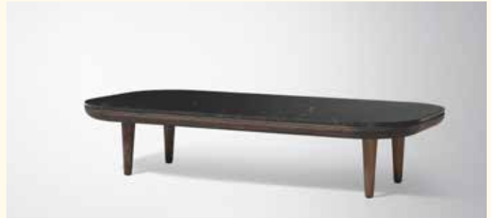
FLY TABLE SC5 BY SPACE COPENHAGEN