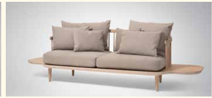
FLY SOFA SC3 BY SPACE COPENHAGEN