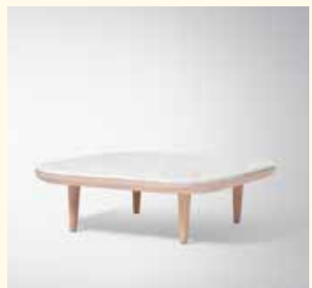
FLY TABLE SC4 BY SPACE COPENHAGEN