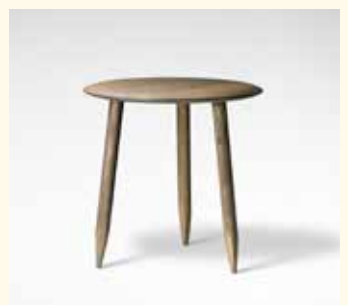
HOOF TABLE SW1 BY SAMUEL WILKINSON