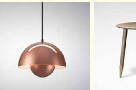
FLOWERPOT VP1 BY VERNER PANTON