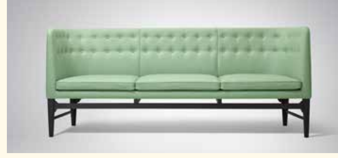
MAYOR SOFA AJ5 BYARNE JACOBSEN & FLEMMING LASSEN