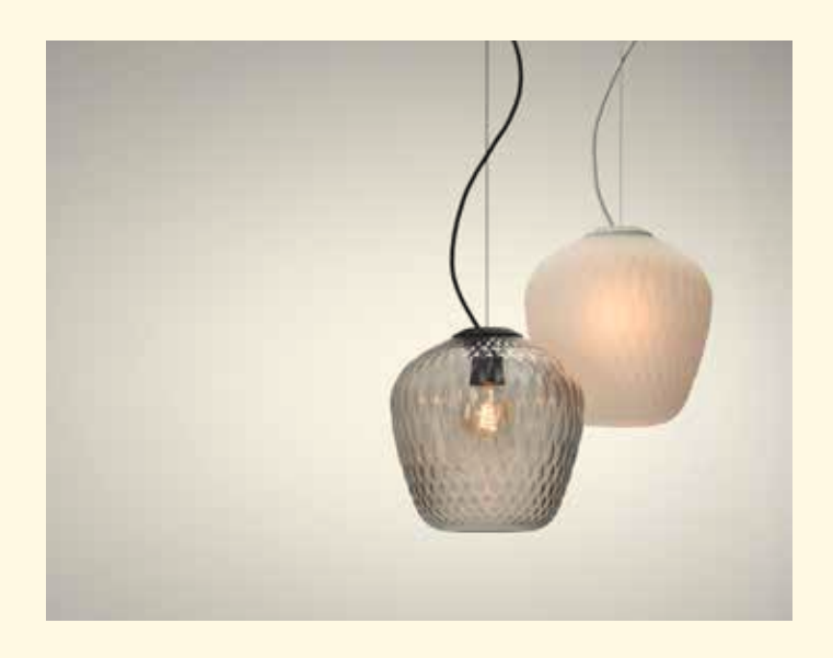
BLOWN SW3 BY SAMUEL WILKINSON