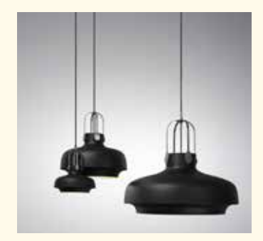
COPENHAGEN PENDANT SC6 SC7 SC8 BY SPACE COPENHAGEN