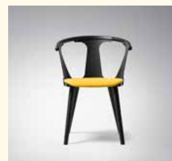
RAFT STOOL NA3 BY NORM.ARCHITECTS