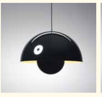
FLOWERPOT VP2 BY VERNER PANTON