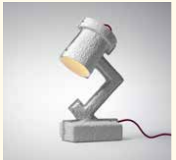
TRASH ME VV1 BY VICTOR VETTERLEIN