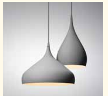
SPINNING BH1 BH2 BY BENJAMIN HUBERT