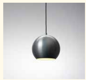
TOPAN VP6 BY VERNER PANTON