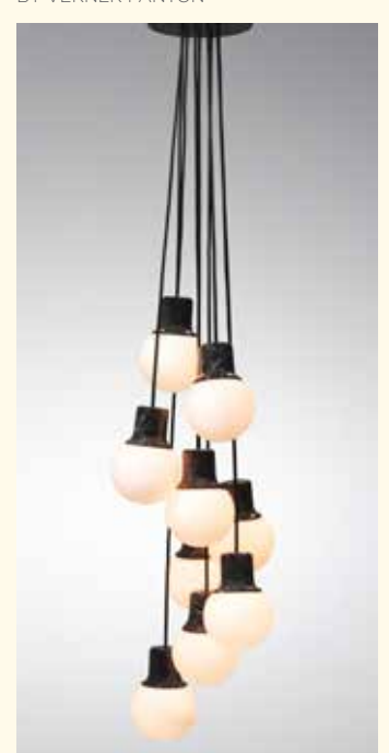
MASS LIGHT NA6 BY NORM.ARCHITECTS