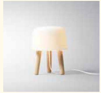
MILK LAMP NA1 BY NORM.ARCHITECTS