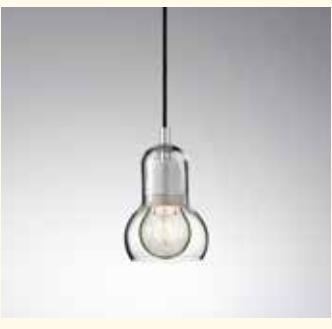
BULB SR1 BY SOFIE REFER