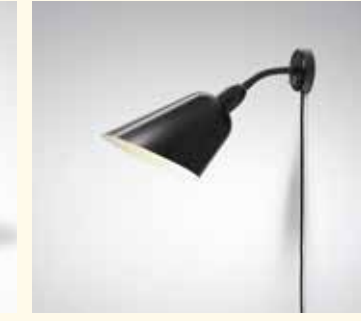
BELLEVUE AJ4 BY ARNE JACOBSEN