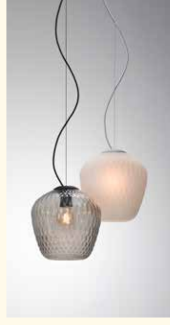
BLOWN SW3 BY SAMUEL WILKINSON