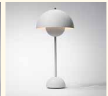
FLOWERPOT VP3 BY VERNER PANTON