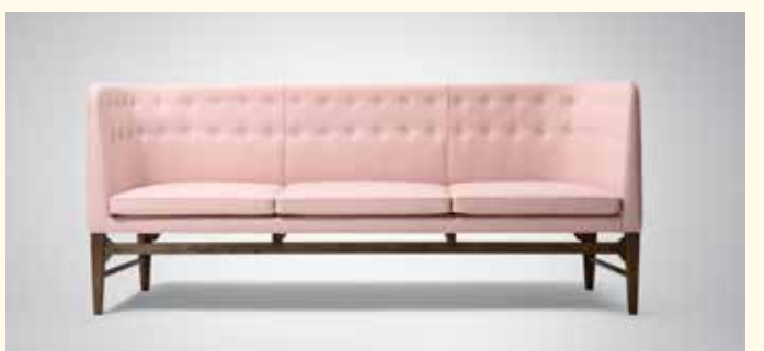
MAYOR SOFA AJ5 BY ARNE JACOBSEN & FLEMMING LASSEN