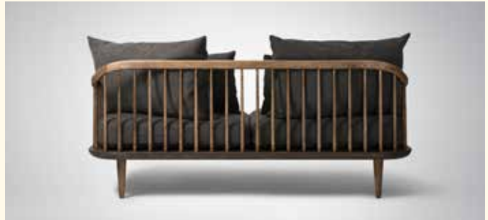
FLY SOFA SC2 BY SPACE COPENHAGEN