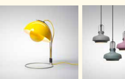
FLOWERPOT VP4 BY VERNER PANTON