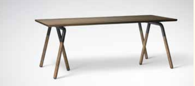
RAFT TABLE NA2 BY NORM.ARCHITECTS