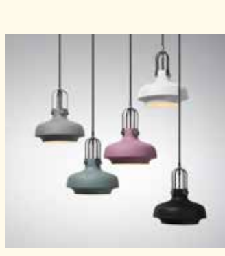
COPENHAGEN PENDANT SC6 BY SPACE COPENHAGEN