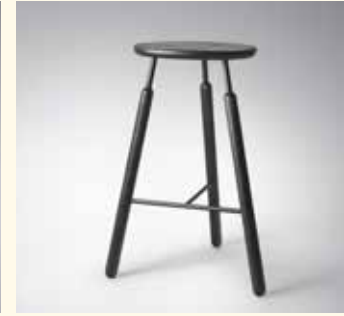
RAFT BAR STOOL NA4 BY NORM.ARCHITECTS