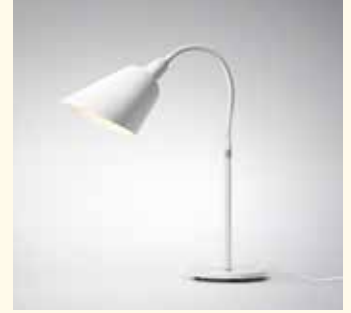
BELLEVUE AJ3 BY ARNE JACOBSEN