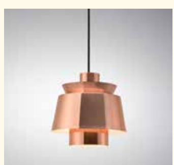
UTZON LAMP JU1 BY JØRN UTZON