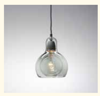
MEGA BULB SR2 BY SOFIE REFER