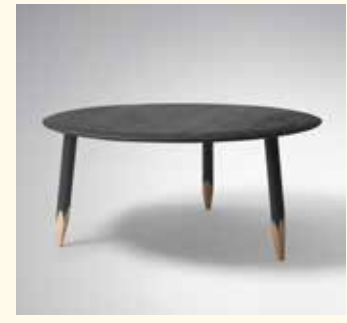
HOOF TABLE SW2 BY SAMUEL WILKINSON