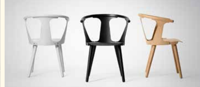
IN BETWEEN SK1 BY SAMI KALLIO