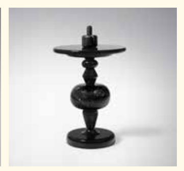
SHUFFLE TABLE MH1 MARBLE EDIT. BY PETER HAGEN