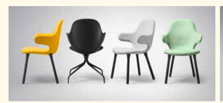
CATCH CHAIR JH1 JH2 BY JAIME HAYON