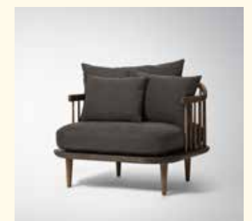
FLY CHAIR SC1 BY SPACE COPENHAGEN