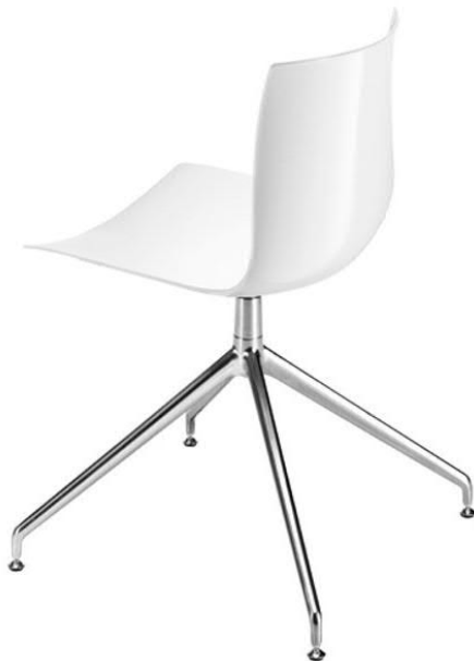
TABLE 2: MATERIALS OF THE CATIFA 46 WITH TRESTLE BASE.