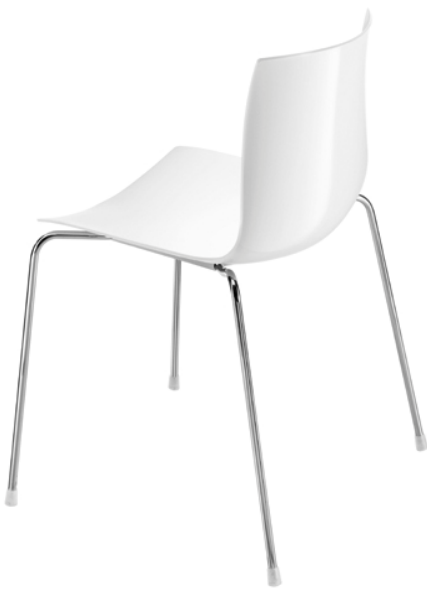
TABLE 1: MATERIALS OF THE CATIFA 46 WITH 4 LEG BASE.