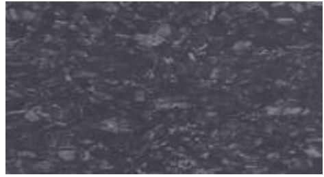
iQ Range flooring

The following figure shows an example of iQ Range flooring: