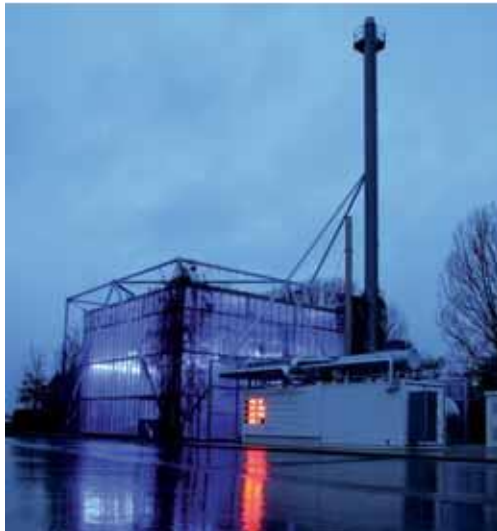
Co-generator powered by renewable raw materials