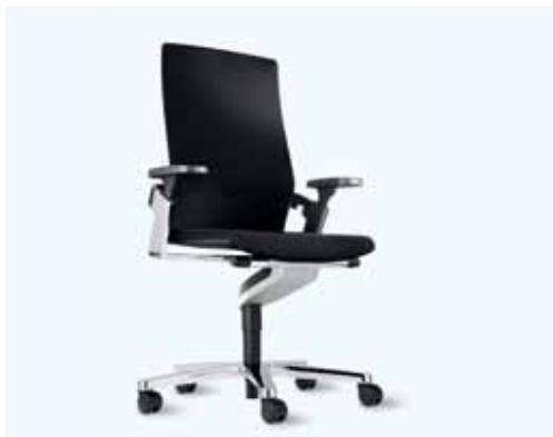
ON. The new dimension in seating. ON range, design: wiege

Leading healthcare professionals and ergonomists have long been pleading for new ergonomic approaches. And ON turns these demands into reality. After five years in development and with Wilkhahn's four decades of expertise in dynamic seating, ON's 2009 world premiere is a unique office chair concept. A chair that gives our bodies the freedom to sit the way they want and can. At the core of the innovative concept lies Trimension®, three-dimensional synchro-supporting kinematics for the seat and back with swivel points that precisely follow the positions of and scope of movement in the knee and hip joints. Therefore, the body's centre of gravity stays in perfect balance – whatever the posture or motion involved. Prof. Ingo Froböse from the Centre for Health accompanied the project and confirms that: "This office chair stimulates a new range of natural postures and movement that activates the entire body. You could say that ON teaches seating how to walk". So ON is a new milestone for better health and enhanced performance in the office, in short: for the next generation in dynamic seating.