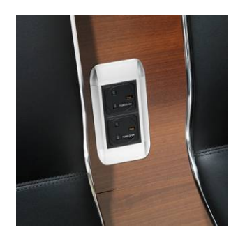
Integrated power sockets to plug in mobile phones or laptops