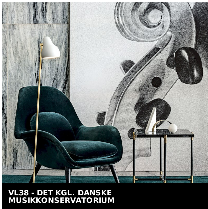
VL38 - DET KGL. DANSKE MUSIKKONSERVATORIUM